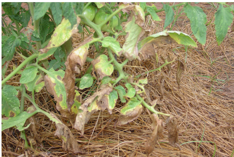
Early blight on tomato plant leaves.

Diseases and viruses on tomatoes can be a real problem for the home gardener. Cultural practices discussed earlier in this publication, along with improved variety selection, will go a long way in preventing disease problems. It makes more sense to maintain a healthy plant and prevent disease problems than to rely on spraying multiple chemicals for control.